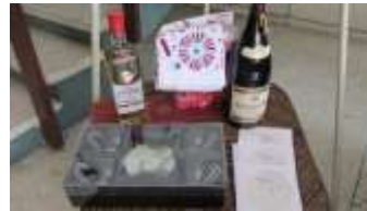
The kitchen crew