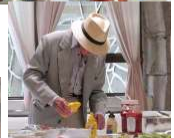
Wait! you don't want mustard! Try Doug's sauce.