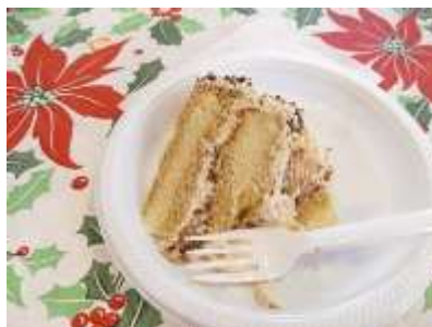
Finished off with Cake!