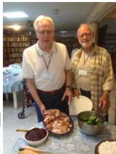
November - Soups, turkey, and veggies