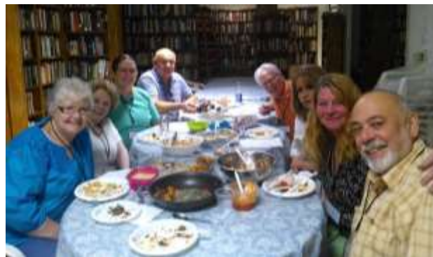
April - TOA already has assembled quite the crew.

Over the last year the group has enjoyed BBQ ribs, smoked turkey, scalloped potatoes with ham, chicken pot pie, and meatloaf just to name a few of the entrees which include a wide variety of tasty main dish salads and yummy soups. Because there are very talented members who love to make pies, cakes and puddings, each meal has ended with some phenomenal desserts!