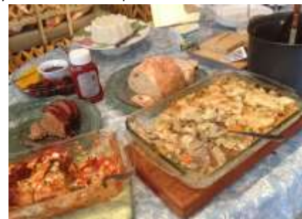
September - Comfort food!