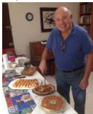
October - Cutting the quiche