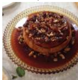
July - Fabulous desserts!