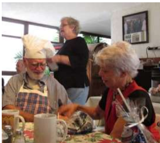
Playing the "Mr. & Mrs. Wright" game