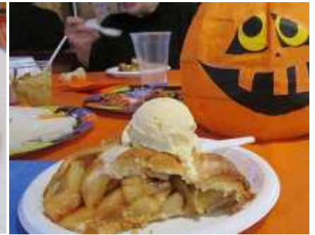
...and apple pie ala mode!