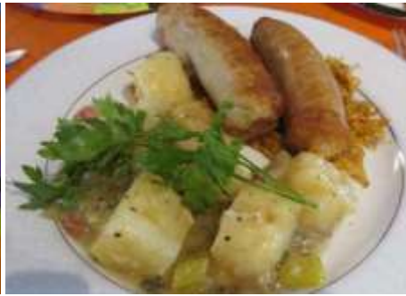
German sausages, potato salad and sauerkraut