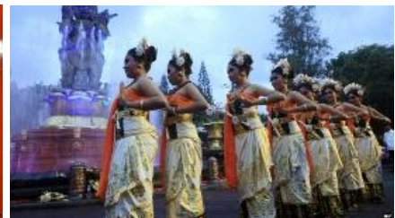
New Year Celebration Tokyo, Japan (L) and Bali, Indonesia (R)