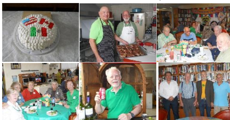
Above right: Saturday English

The volunteers at the desk can help you to use the library effectively. The library volunteers are knowledgeable about many of the books. If you haven't tried the library before, try it now and disappear into another world—whether it is the world and time of famous men or women, or a novel set in a part of the world you have never visited, or that never existed.